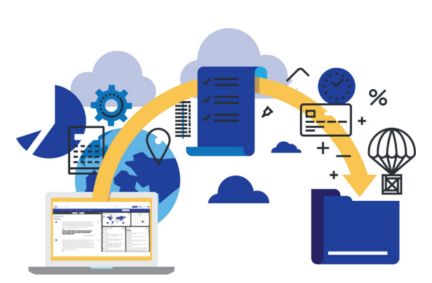
2,280 DAILY REPORTS IN MAR ARCHIVE

MAR combines the assistance of local MA experts with web monitoring. MAR collaborates with rooted experts, who assess and prepare relevant data daily. This ensures that users receive MA-related information of the highest quality and importance. The MAR team gathers data from over 50 countries. If a user needs more information about the given record, either concerning the local market or due to the need for additional analysis, the user can click "Ask the Expert" for a question about the selected topic. This is available for each record.